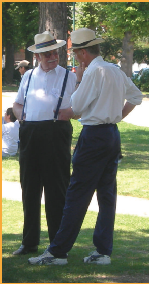
ABOVE: Tea and scones!